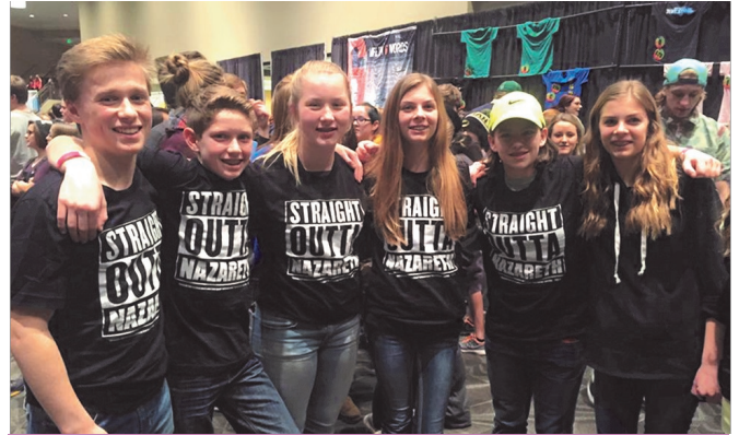
A group of students from The Cross attended Dare2Share in February at Grace Church in Edina MN.

The Confirmation services will be held at the Downtown site. Please be in prayer for these students, and all who make confessions of their faith.